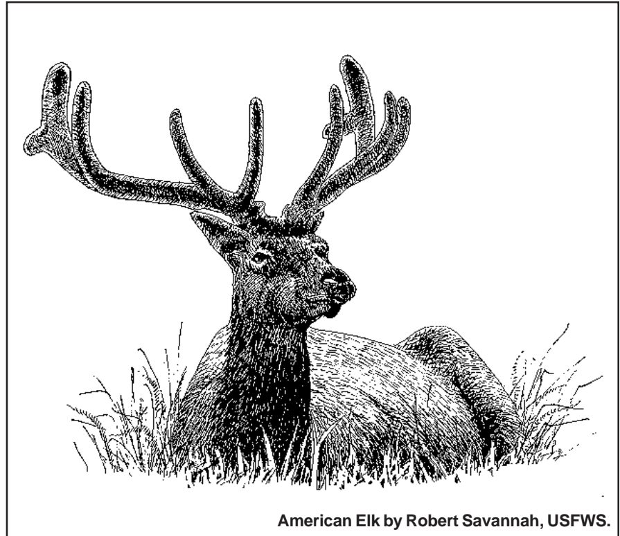
American Elk by Robert Savannah, USFWS.

By reducing the numerical abundance of a competitively dominant prey species (or by changing its behavior), carnivores erect and enforce ecological boundaries that allow weaker competitors to persist (Estes et al. 2001). If a predator selects from a wide-range of prey species, the presence of the predator may cause all prey species to reduce their respective niches and thus reduce competition among those species. Removing the predator will dissolve the ecological boundaries that check competition. As a result, prey species may compete for limited resources and superior competitors may displace weaker competitors leading to less diversity through competitive exclusion (see Paine 1966; Terborgh et al. 1997; Henke and Bryant 1999). The impact of carnivores thus extends past the objects of their predation. Because herbivores eat seeds and plants, predation on that group influences the structure of the plant community (Terborgh 1988; Terborgh et al. 1997; Estes et al. 1998). The plant community, in turn, influences distribution, abundance, and competitive interaction within groups of birds, mammals, and insects.