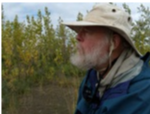
taken on the Noatak

Dave Foreman Adapted from Take Back Conservation .